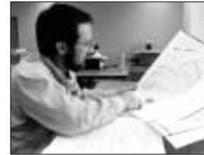
Title and History Research